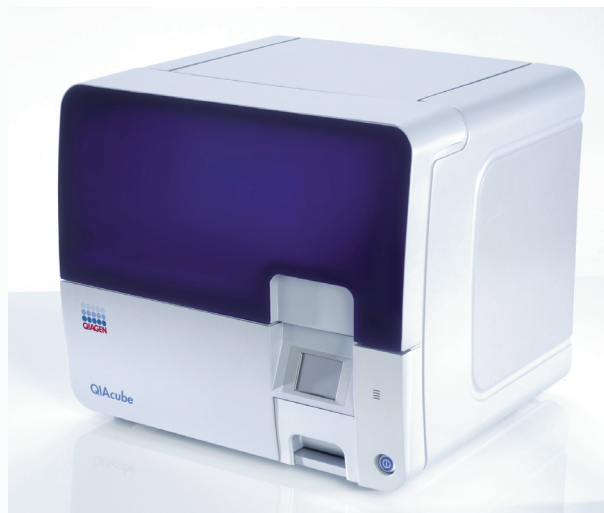
Figure 1. The QIAcube. Samples can be processed manually or automated on the QIAcube.

* For Research Use Only. Not for use in diagnostic procedures. No claim or representation is intended to provide information for the diagnosis, prevention, or treatment of a disease.